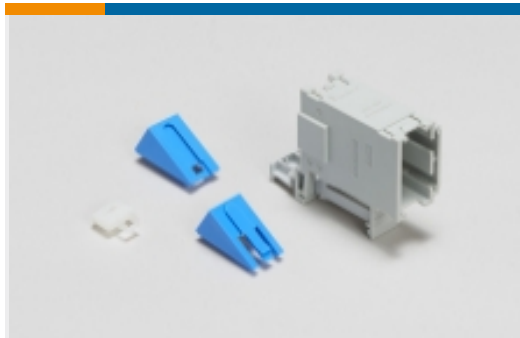
Rectangular Connector Adapters(2)